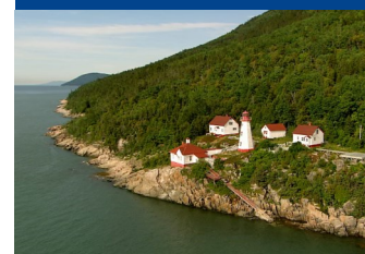
Enjoy the picturesque views of Charlevoix