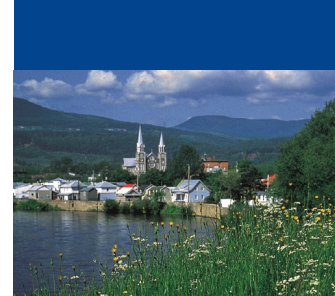
The beautiful Charlevoix Region of Québec.

Day 9: Enjoy a Continental Breakfast before departing for home... A perfect time to chat with your friends about all the fun things you've done, the great sights you've seen and where your next group trip will take you!