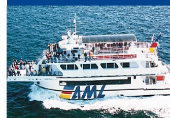
Whale Watching Cruise on Bay St. Catherine.